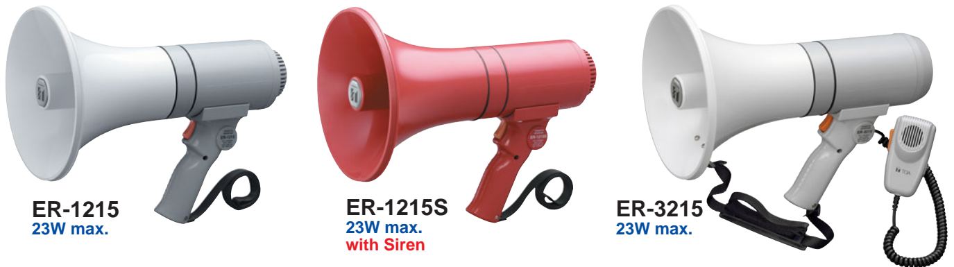
ER-1215 23W max.