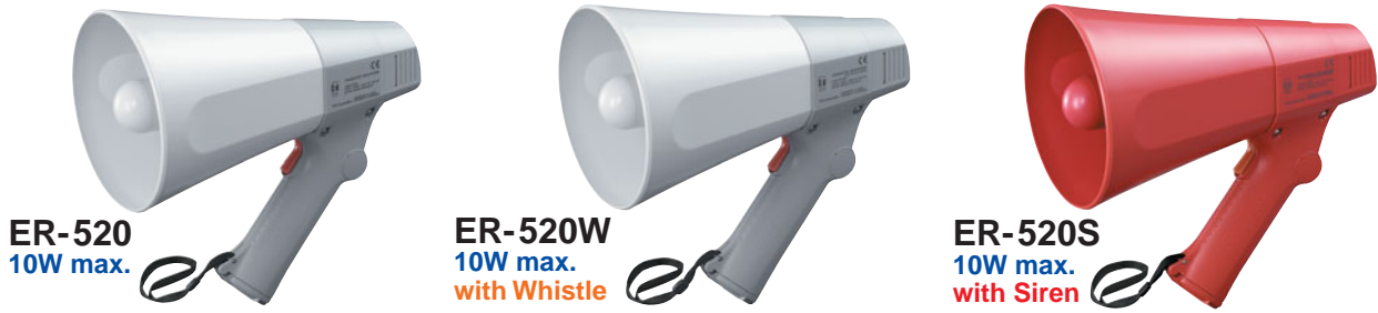
ER-520 10W max.